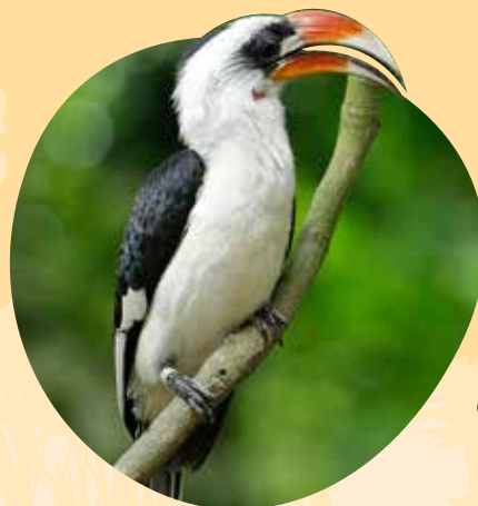
Von der Decken's hornbill