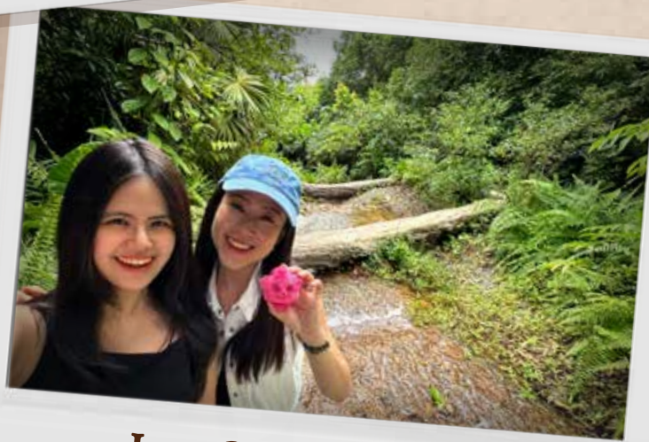
Log Crossing Trek